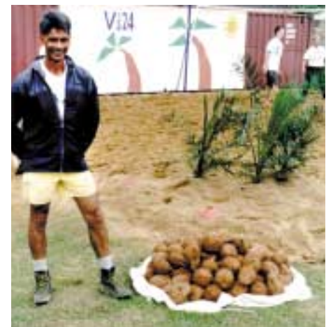
Coconuts for prizes!